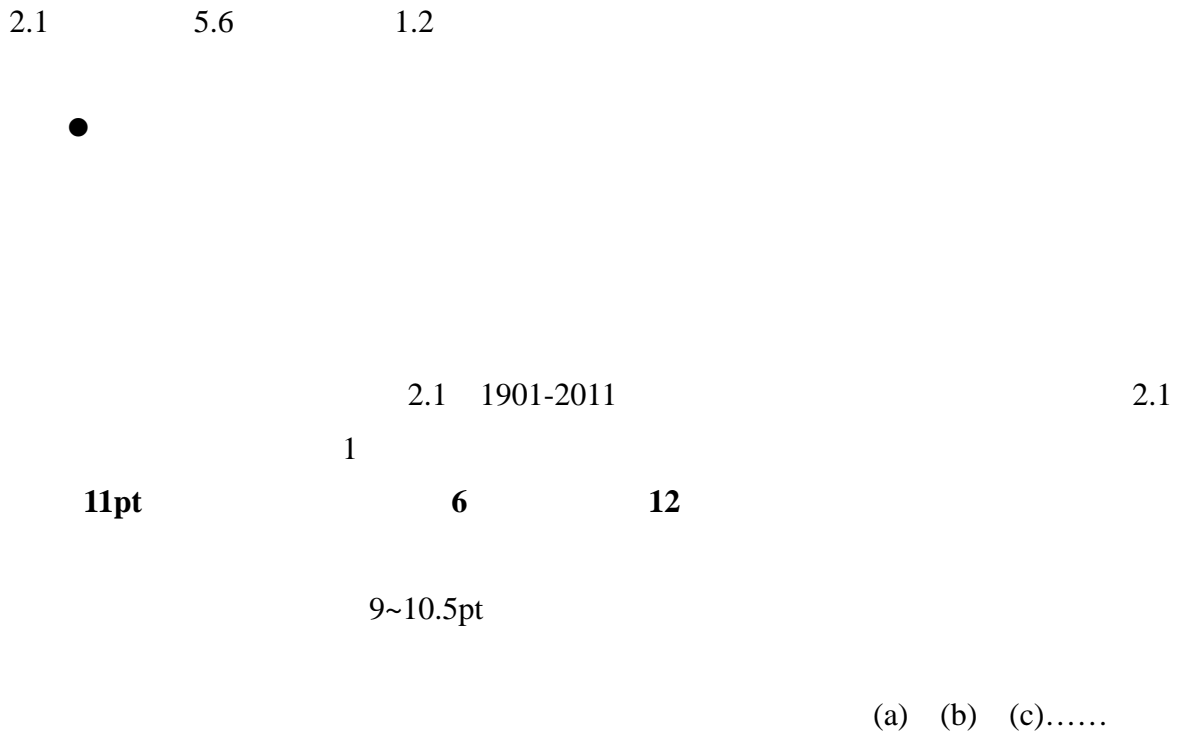
Fig 2.1 Distribution of annual mean temperature Northwest China from 1901 to 2011